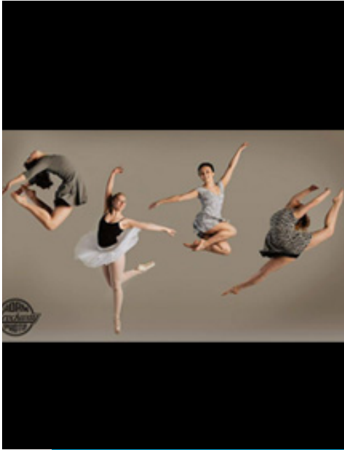
Our Photo of the Month

Dancercenter of Utica 2007 Genesee Street Utica NY